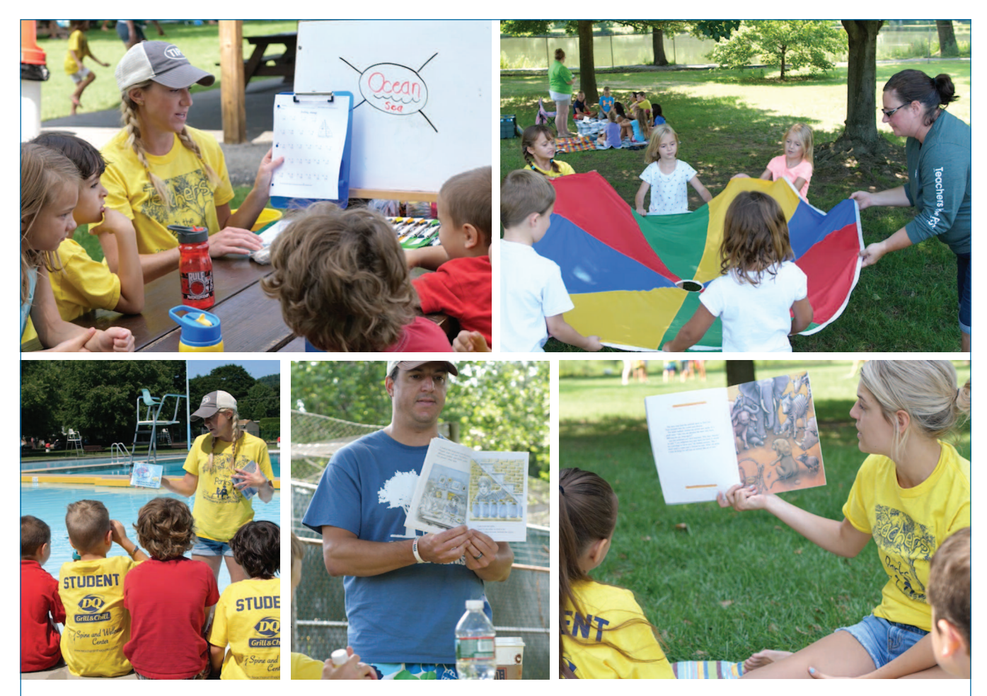
Teachers spend summer days working with students in a Teachers in the Parks program in the Exeter Township School District.

diversity, and advocacy for fellow educators. 💟