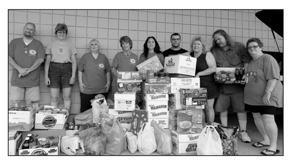
At the close of the 2016-17 school year, the Neshaminy ESP coordinated a food drive to collect non-perishable items from district employees. The drive was an overwhelming success, bringing in more than 1,200 pounds of food that was delivered to four area food banks for distribution during the summer months. This project greatly benefited district students who typically rely on the school district for their meals.