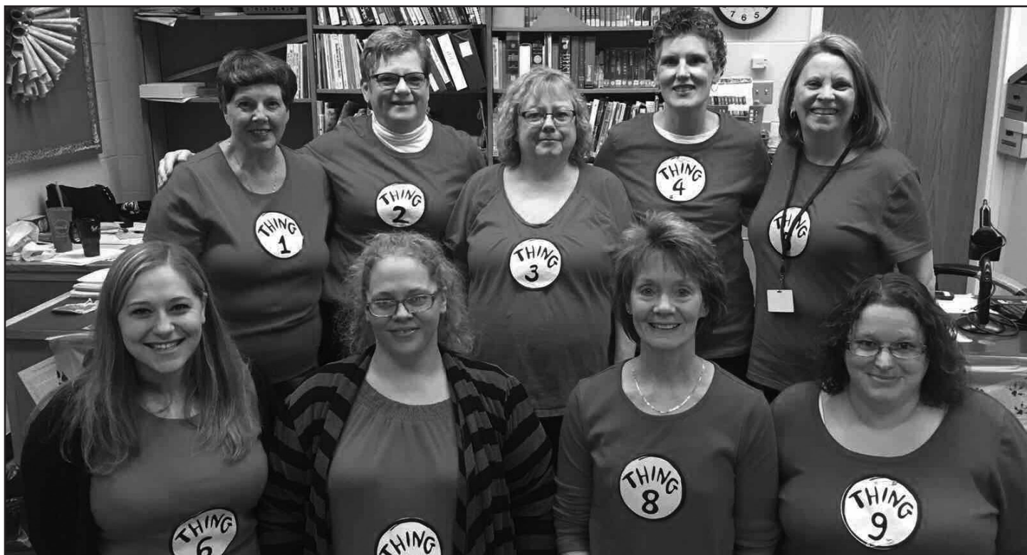
Oil City ESP members pose for a photo on Read Across America Day, March 2. Students and teachers invited them to be guest readers in various classrooms in the elementary building. The members chose their favorite Dr. Seuss books to read to the students.