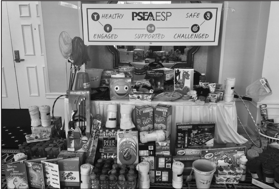
A statewide ESP initiative to collect summer supplies for K-5 students in the Chambersburg Area School District was a great success. At division meetings throughout the spring and during the 2017 ESP Region House of Delegates in April, many members contributed items that meet the needs of the whole child. Donations ranged from healthy snacks and drinks to books and games to sand buckets. All items collected were related to ensuring students that are healthy, safe, engaged, supported, and challenged. The response was overwhelming, and we thank everyone who donated.